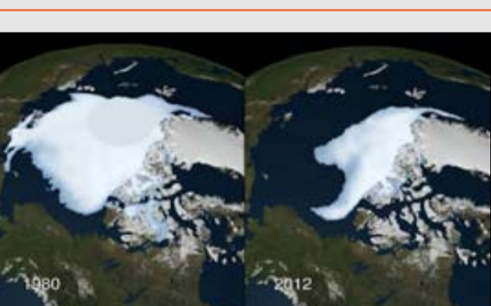
Arctic ice, 1980 and 2012